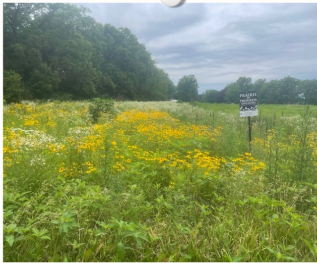
SECOND YEAR POLLINATOR