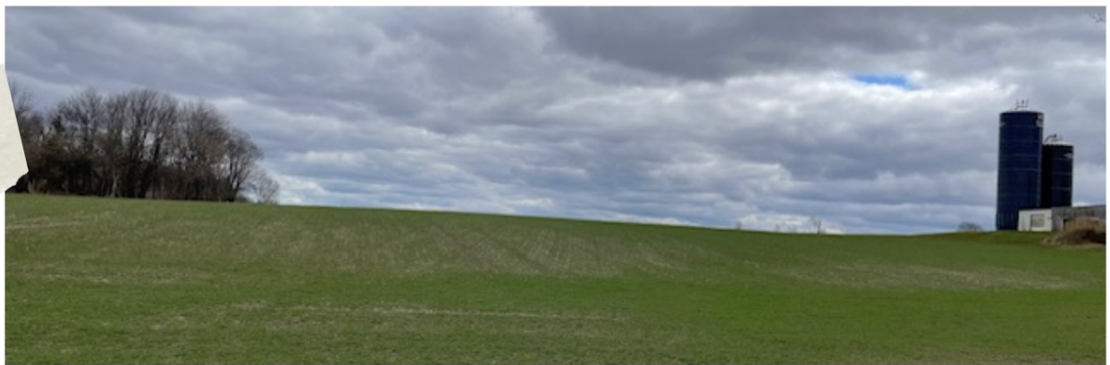
COVER CROPS - SPRING 2024