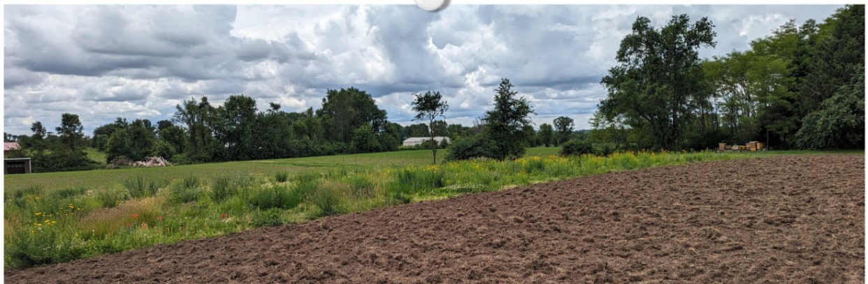
POLLINATOR ENHANCEMENT SPRING 2024 PLANTING/EXPANSION OF POLLINATOR