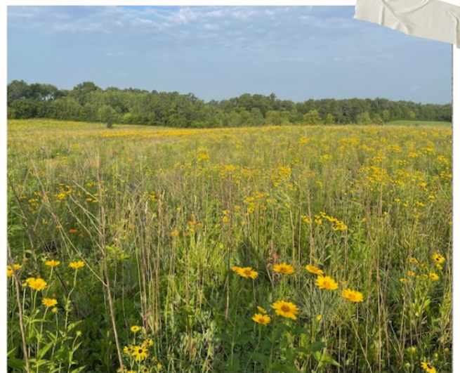
THIRD YEAR POLLINATOR