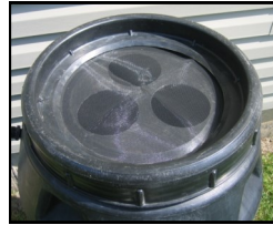
The removable screen mesh lid on all rain barrels